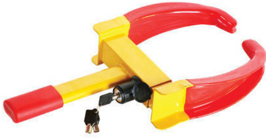
Car Wheel Lock Clamps with 3 Keys Model no: ABAXN-CWL